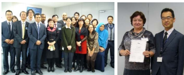
Left: with participants, Right: presentation of certificates

http://www.pmda.go.jp/english/events/1st_pmda_medical_devices_training_seminar.html