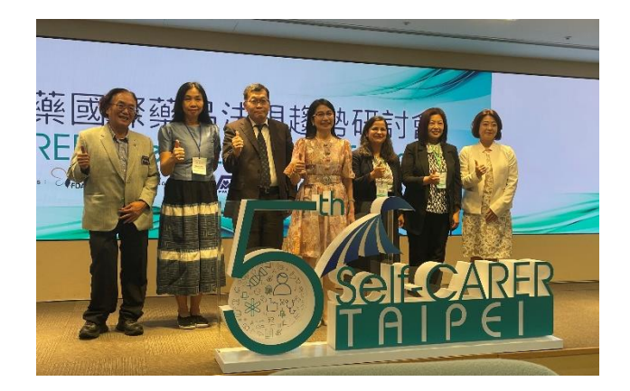
Group photo of co-chairs and others