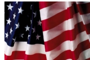
Food and Drug Administration (FDA)