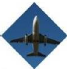
Portos, Aeroportos e Fronteiras