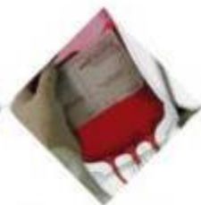
Sangue, Tecidos e Órgãos