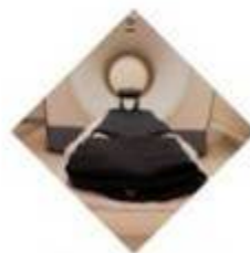
Produtos para Saúde