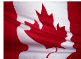
Health Canada (HC)