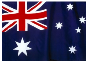
Therapeutic Goods Administration (TGA)