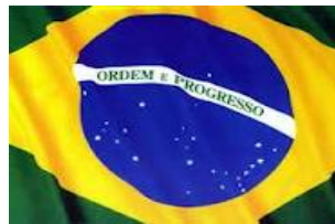
Agência Nacional de Vigilância Sanitária (ANVISA)