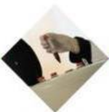
Serviços de Saúde