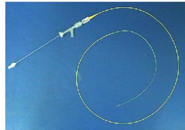
Figure 2. Delivery system