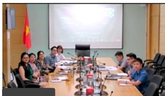
Group photo of participants the symposium participants